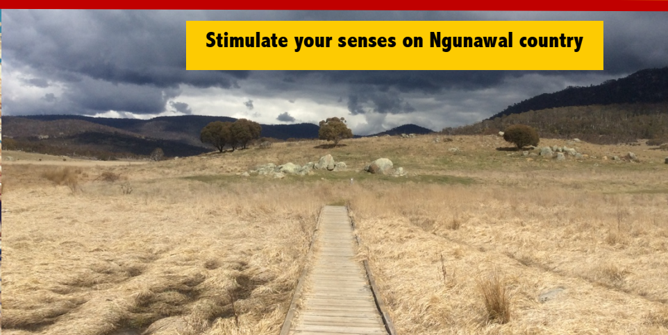
Stimulate your senses on Ngunawal country

CONTACT US TODAY ON 0407517844 or 02 6285 4802