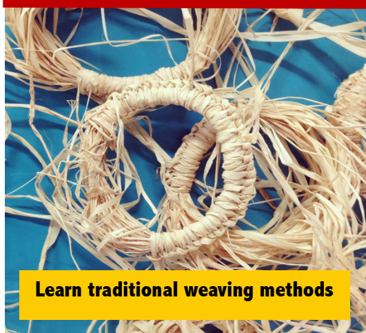
Learn traditional weaving methods